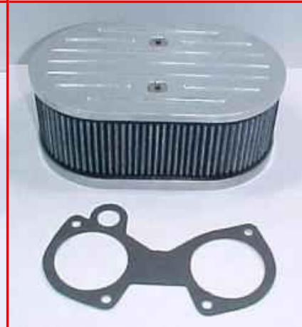
$92.00 99217.435 $34.95 99400.212G (element only) Billet Style 4-3/8 x 7-3/16 x 2-1/2"