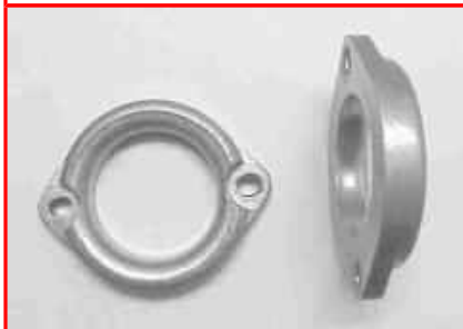
AH829 Short 13 mm air horn for 40 DCOE Click for Outline Drawing