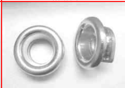
AH820 40 mm air horn for 40 DCOE Click for Outline Drawing