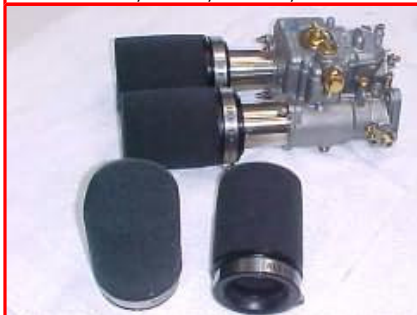
$27.95 09-9040 Clamp on POD Filters for air horn applications. (Shown On 45 DCOE-9 carburetor). Supplied as set of 2 for 1 carb