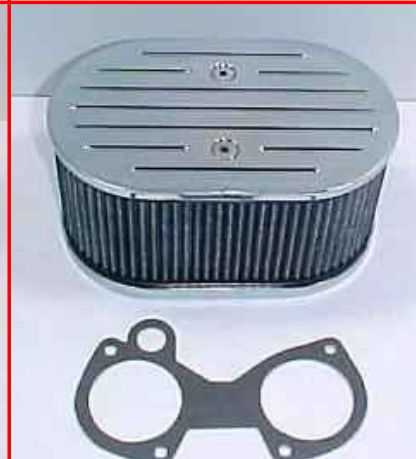
$105.00 C-99217.432 Chrome Billet Style 4-3/8 x 7-3/16 x 3-1/4"