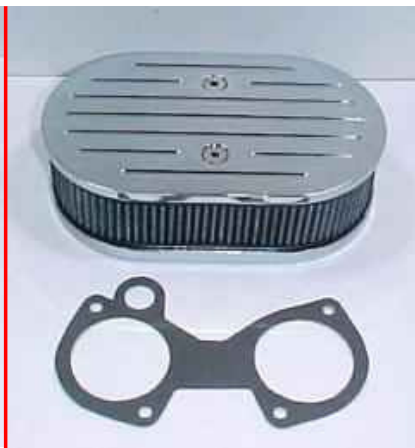
$105.40 C-99217.438 Chrome Billet Style 4-3/8 x 7-3/16 x 1-3/4"