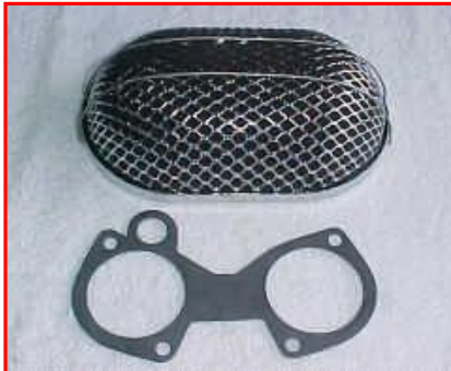
$24.95 1093 $4.95 1118B (element only) W 4-1/2" L 7" H 2-1/4"