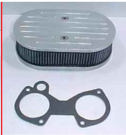
$80.00 99217.438 Billet Style 4-3/8 x 7-3/16 x 1-3/4"