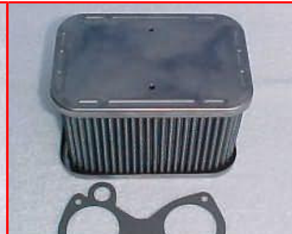
$52.15 Z70/156 KN Elements W 4-1/2" L 6-3/4" H 4"