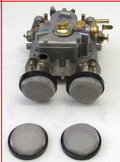
$35.00 99217.225 (Pair) Filter fits on air horn bell using patented lip lock technology with radiused entry for great signal and air flow. Three layer stainless steel filtering down to .009 with virtually no air flow restrictions