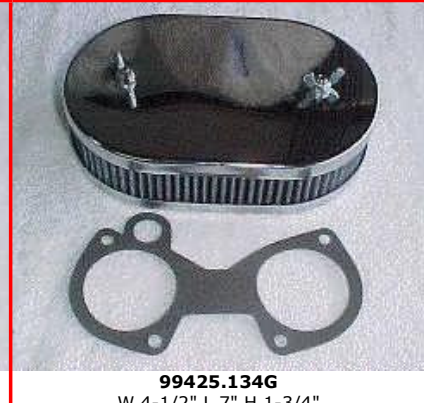
99425.134G W 4-1/2" L 7" H 1-3/4"