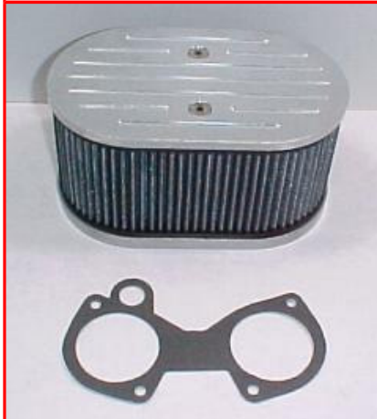
$80.00 99217.432 $15.95 99400.400G (element only) Billet Style 4-3/8 x 7-3/16 x 3-1/4"