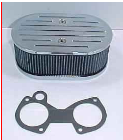
$105.40 C-99217.435 Chrome Billet Style 4-3/8 x 7-3/16 x 2-1/2"