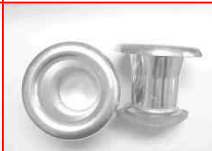
AH821 75 mm air horn for 40 DCOE Click for Outline Drawing