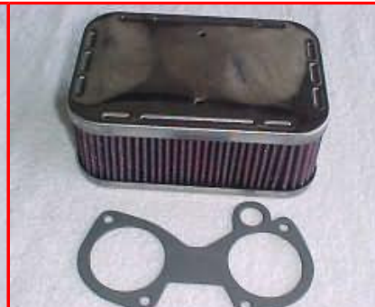
$44.80 Z70/149 KN Elements W 4-1/2" L 6-3/4" H 2-1/2"