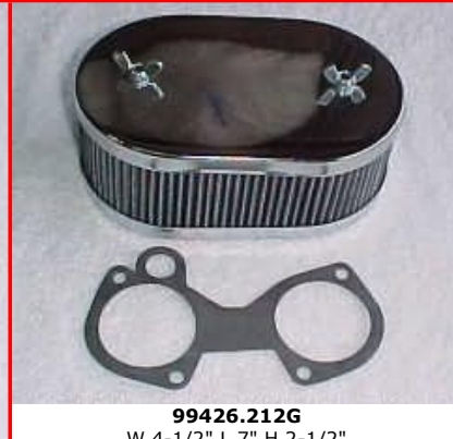
99426.212G W 4-1/2" L 7" H 2-1/2"